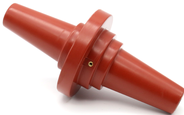
Feed-thru Apparatus Bushing Part No. WEETG-ST